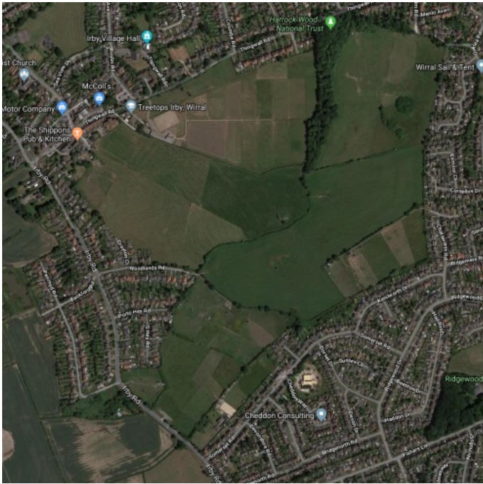
Site SP060 South of Thingwall Road (joining Irby, Thingwall & Pensby)